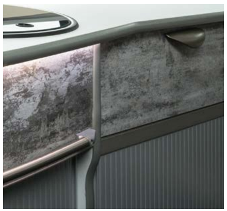
New Formwork cabinetry colour available.

Throughout our interiors we use Euro4-standard plywood, a material that does not contract, swell and warp. This water resistant, lightweight and nondeformable material has an exceptional finish as seen in our kitchen drawers. While custom cutlery space is included in the kitchen, all remaining drawers come in a variety of depths to accommodate assorted storage. Easy to clean and remove, all drawers have self-latching locks and reliable multi-ball bearing runners, which provide a smooth running and silent closing function.